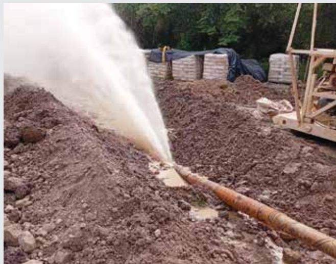
Initializing drilling activities for pilot hole