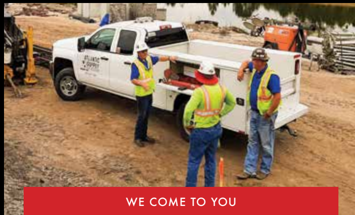
WE COME TO YOU