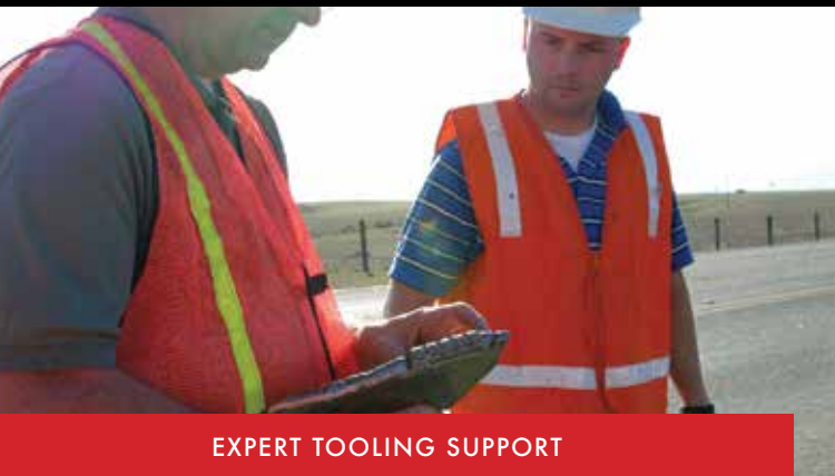
EXPERT TOOLING SUPPORT

HDD'S LARGEST INTERNATIONAL NETWORK OF TOOLING SUPPLIERS & SUPPORT