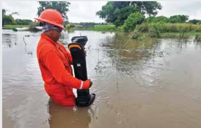
Underground Magnetics Mag 9 receiver being used to guide the drill head.

These five companies continue their quest of reaching higher achievements in the pipeline installations. They have a full schedule filled with new challenges that will continue to test the available equipment needed to complete mega projects.