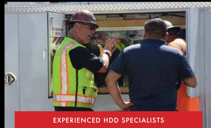
EXPERIENCED HDD SPECIALISTS