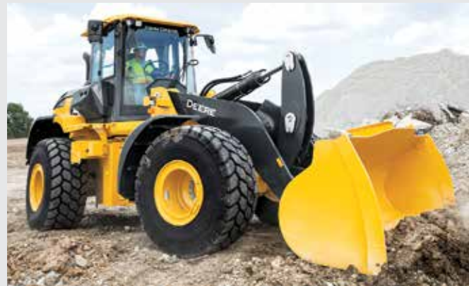
The 644 X-Tier Mid-Size Wheel Loader is built for the times you need peak performance and efficiency.

But it's not just about what the machine gets done, it's about how the 644 X-tier does it. It possesses the state-of-the-art technology and features that help get work done efficiently, like an innovative electric-drive system