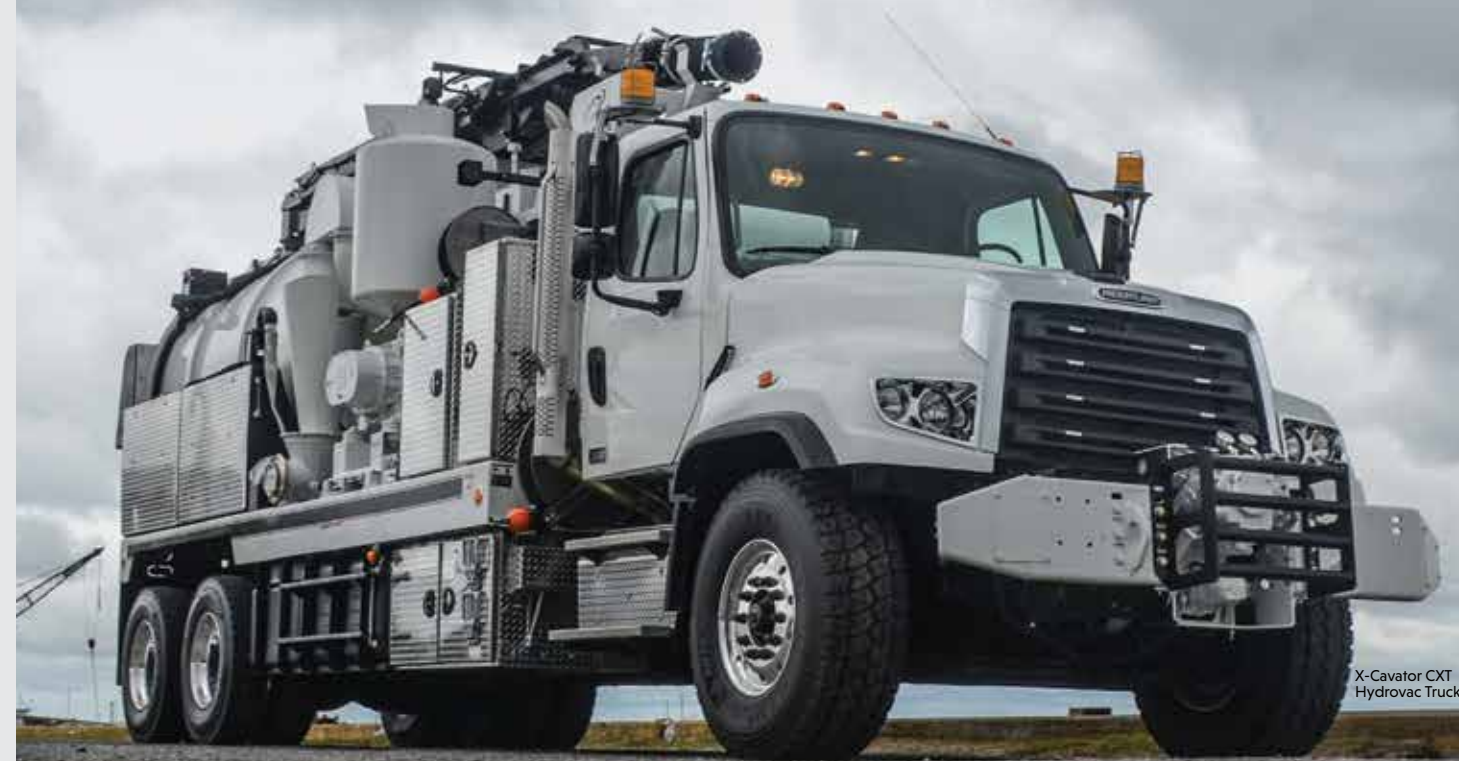
X-Cavator CXT Hydrovac Truck